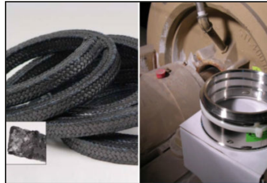
SpiralTrac device with Chesterton 1830 packing SuperSet.