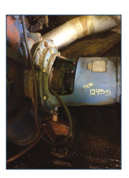
Wemco 3112 Tank Pump with SpiralTrac FIRST Device Installed

Product: Paper Stock Pressure: 3.8 bar (55 Psi) Shaft Size: 3.937" (100 mm)