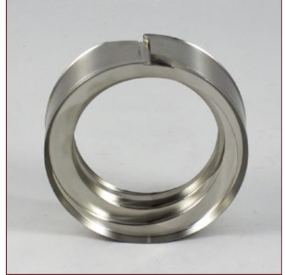
Version D SpiralTrac 316 material