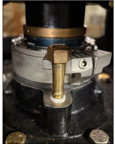
Chesterton Solution Installed

This solution was installed in 2007, and it has been running with no issues up until early 2025, when pump had an unrelated bearing failure.