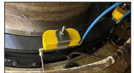
AMPS System Installed