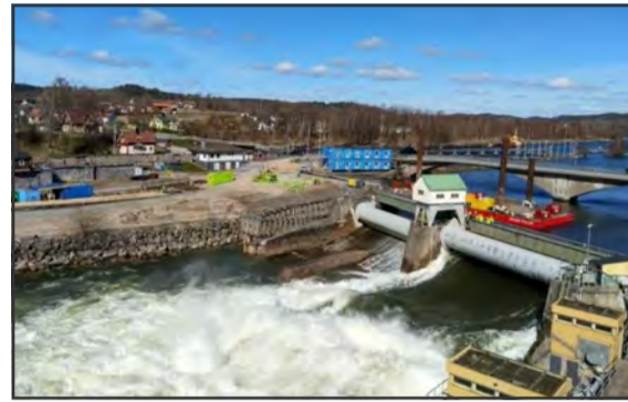
Hydro Power plant in Sweden