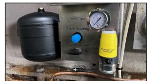
Custom made control panel with Chesterton Connect monitoring

For more information please send an email to us at support@enviroseal.ca . We hope to hear from you!