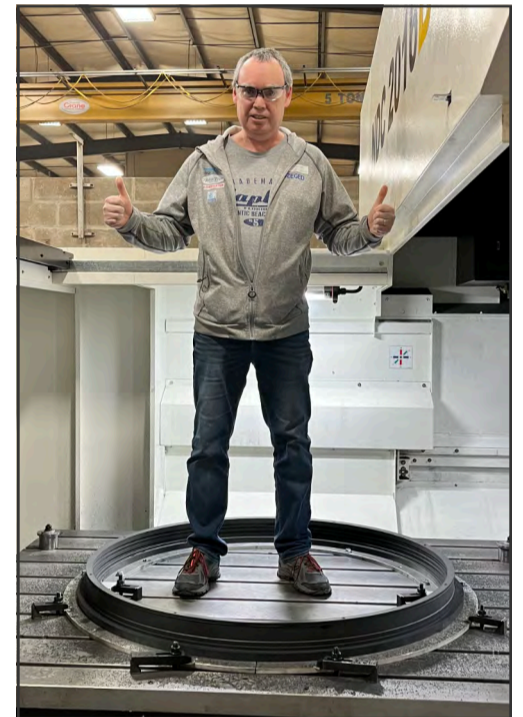
Largest SpiralTrac manufactured to date (Jan 2025)

Equipment startup was in September 2023, the application has been running successfully ever since . The controlled leakage is very clean thanks to the SpiralTrac. Customer is very happy with the ability to monitor and adjust gland force remotely and is already looking to implement the same solution at other equipment at the plant. Chesterton Connect is used to monitor the AMPS feed pressure.