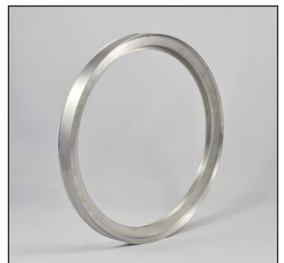
Version N Type I SpiralTrac made of 316

For more information please send an email to us at support@enviroseal.ca . We hope to hear from you!