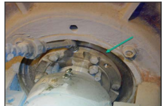
Chesterton Solution Installed, zero leakage

Flush water amount greatly reduced and pumps no longer require constant packing adjustments and maintenance. MTBF on these pumps were 2.5 and 3 years respectively, with an estimated savings over $20,000 in parts alone. Customer is very pleased with the results and has reordered the same solution when seal eventually failed.