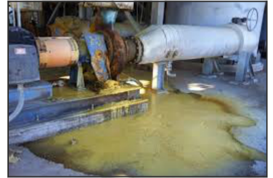
Excessive product leakage, frequent packing failure

Customer was experiencing frequent packing failures on two of their wet atomized Zinc pumps. Repacking the pumps were costly and had to be done often, associated cleaning costs were also high. Frequent sleeve replacements. Customer was hoping to reduce high volume flush water usage.