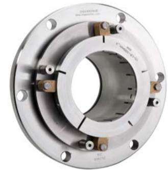
Chesterton 170L Heavy Duty Slurry Seal