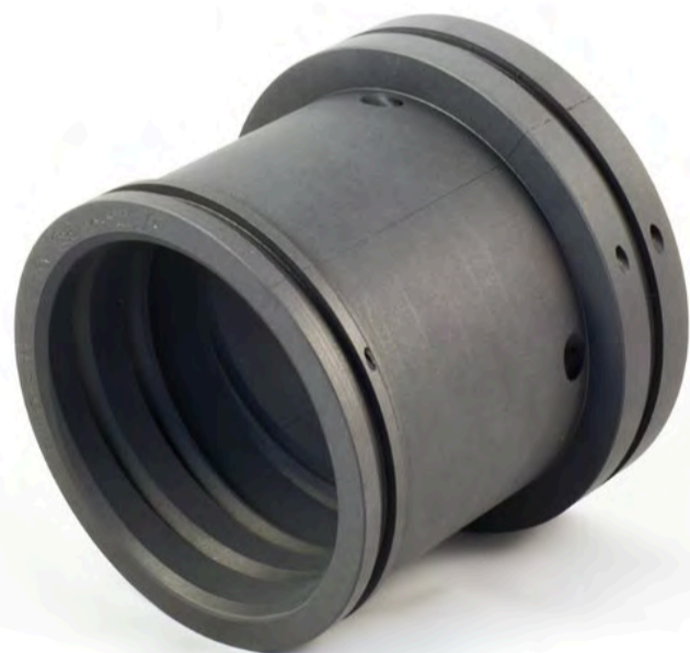
SpiralTrac FIRST Device