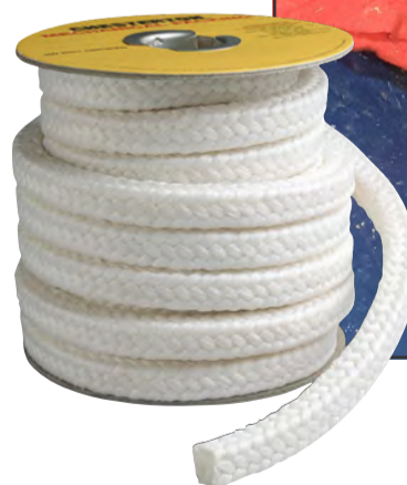
Chesterton 1730 Packing

For more information please send an email to us at support@enviroseal.ca . We hope to hear from you!