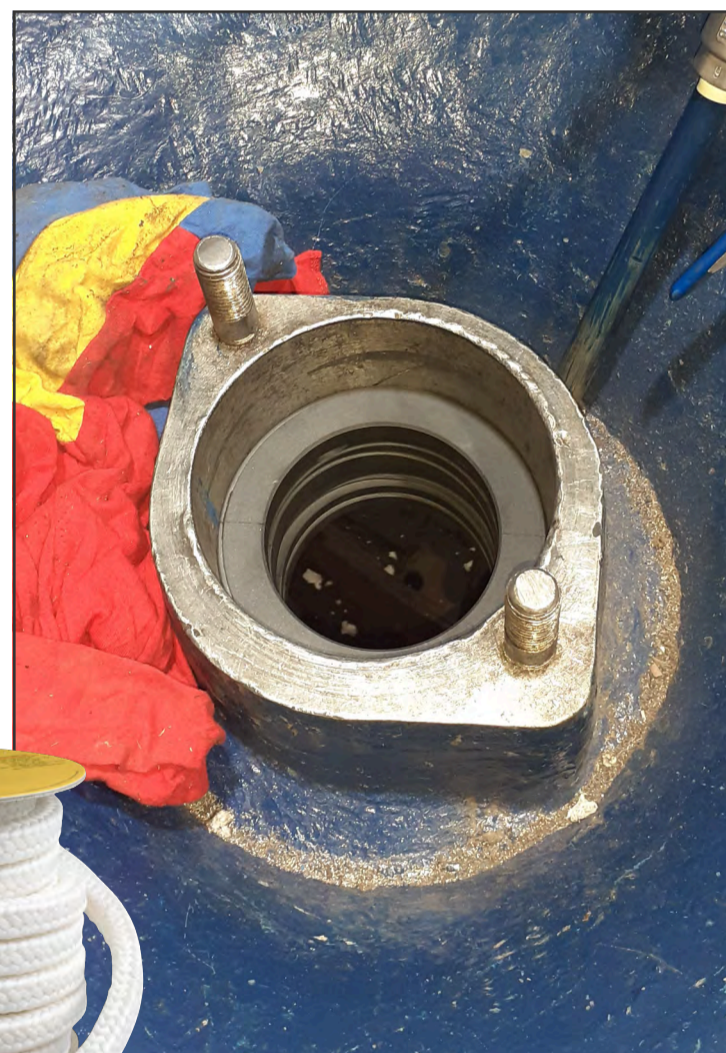
SpiralTrac being installed