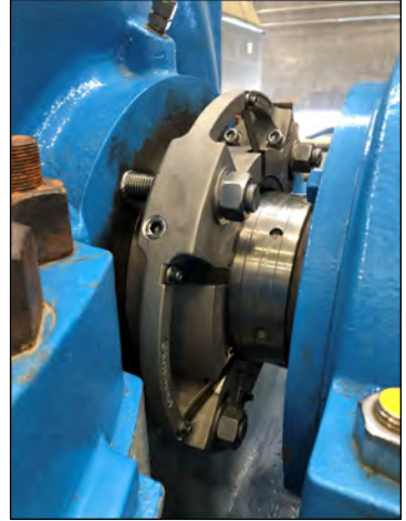
Chesterton Solution installed

Previously packed with competitor injectable packing. Problems with excessive leakage and premature failure.