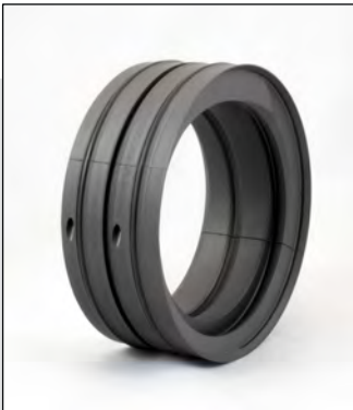
Version F SpiralTrac

Installed with a plan 32 (clean external flush) setup. Seals installed without any startup leakage. In operation for 9 months (as of writing).