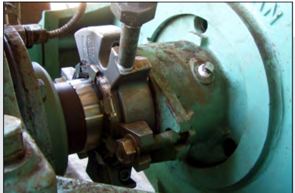
Chesterton solution being installed

For more information please send an email to us at support@enviroseal.ca . We hope to hear from you!