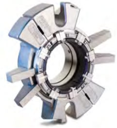
442C Split Seal

Previously packed application. Excessive sleeve wear and flush leakage.