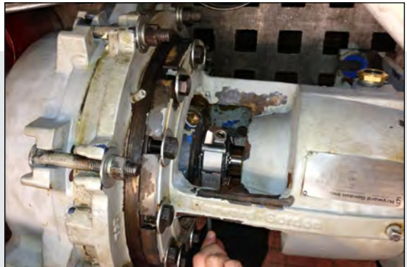
Chesterton solution being installed

For more information please send an email to us at support@enviroseal.ca . We hope to hear from you!