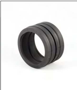
Version F SpiralTrac

Installed with a plan 32 (clean external flush) setup. Seals installed without any startup leakage. In operation for 9 months (as of Jan 2023).