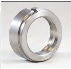
SpiralTrac Version N Type A

First installed January 2016, running leak free for 23 months (as of Dec 2017)!