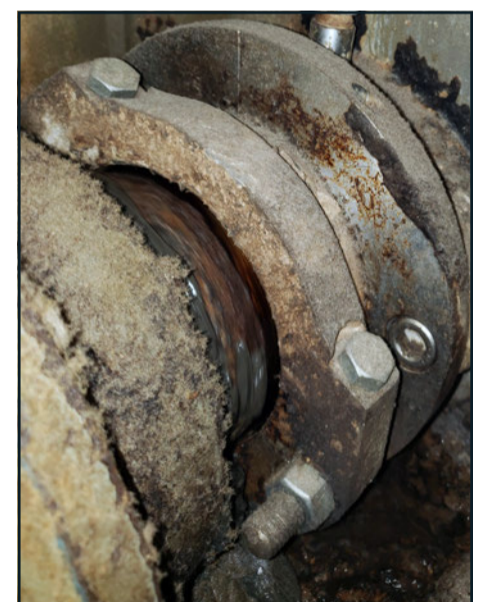
Brown Stock Repulper Stuffing Box

* EnviroSeal always recommends flow controls when installing a Packing Version SpiralTrac.