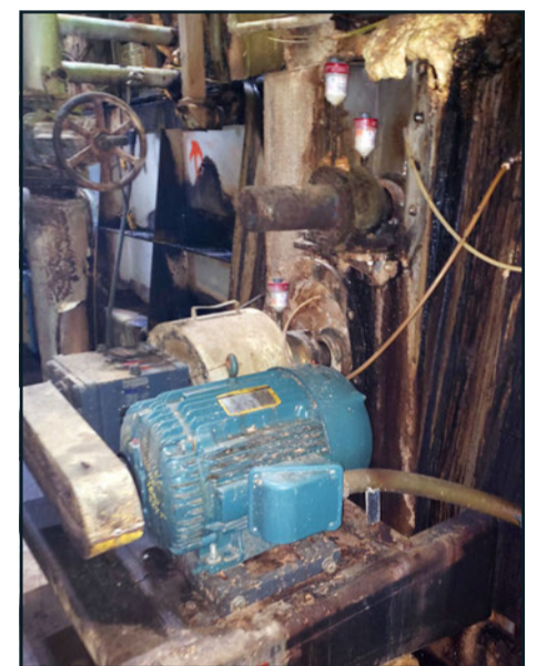
Brown Stock Repulper

There are significantly less packing adjustments necessary, and because of the clean drip rate leakage, the area around the washers are cleaner, lowering housekeeping efforts. This upgrade was incredibly successful as per customer, who reordered the same set of SpiralTracs in 2022.