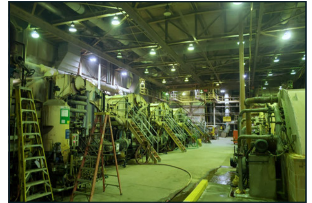
Brown Stock Washing Station

Customer was looking to extend packing life to increase equipment reliability and stabilize cost of operation.