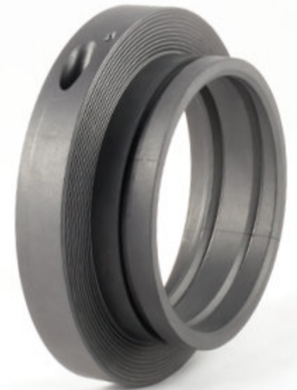
SpiralTrac Seal Adaptor

This application is demanding and already required an advanced sealing system to match the requested goals of reliability. Goal is reduction in unplanned downtime costs because of failure, worth thousands per day.