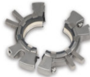
442 Split Seal