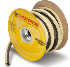
Chesterton DualPac® 2211 Packing for Severe Slurry Applications

Customer set up high flush pressure to the stuffing box, thinking that the higher flush pressure will help seal the box. This resulted in excessive spraying at the gland, constant packing adjustment and frequent sleeve replacements.