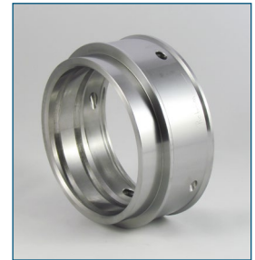
Packing Version SpiralTrac

Application has been running for 3 years with original SpiralTrac and packing rings, no issues. No repacking needed in three years! Flush water significantly reduced, spraying at the gland eliminated.