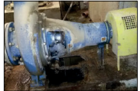
Excessive product leakage

The challenges with sealing abrasive media are the short life of packing and fast sleeve wear.