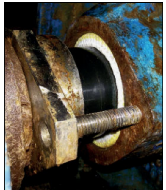
Chesterton Solution Being Installed

"We have just positive installation experiences with smooth start-up and break-in of packing." - feedback from customer