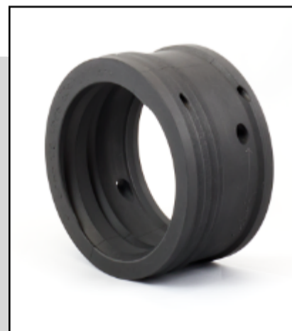
Packing Version SpiralTrac