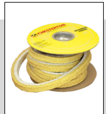
DualPac 2212 Packing

For more information please send an email to us at support@enviroseal.ca . We hope to hear from you!