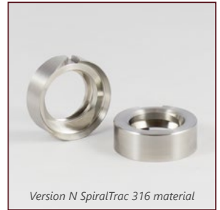
Version N SpiralTrac 316 material

MTBF on the first pump converted to this solution lasted for 40 months . Since then, many more pumps were converted with similar success. Now every dirty water process at the mill has been standardized with this sealing solution.