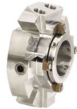
Chesterton S10™ Single Cassette Seal