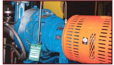
GOULDS 3196 MTX with SpiralTrac installed

Customer has numerous potato washing stations with Goulds 3196 MTX pumps. Product is water with dirt, sand, silt etc. being washed off of the potatoes. Previous sealing solution is a competitor single bellows seal with an average 10 month seal life. Customer is looking to extending seal life and increase overall reliability.