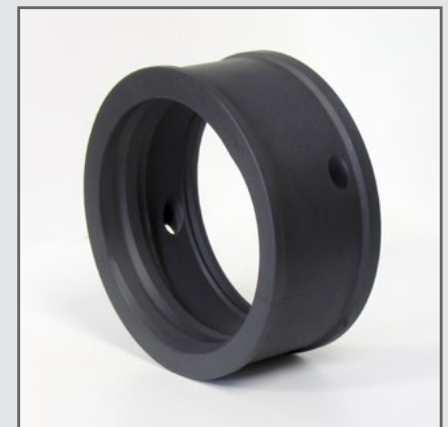
SpiralTrac Part # PM10000RS13200(ESC)0L64.00

If this Success Story has piqued your interest and would like to know more, our technical support team can always be reached at support@enviroseal.ca