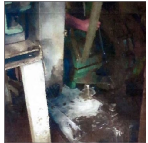
Flush water leakage all over the floor resulting hazardous operating conditions

Before mill shutdown, flow meter readings were measured on the three pumps in question. At shutdown the Specialist converted the 2L3 setup and installed a Packing Version SpiralTrac™ with 3 rings of Chesterton 18030SSP™ packing.