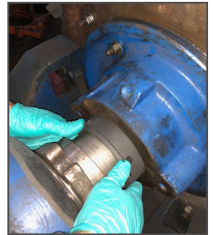
SpiralTrac being pushed into the stuffing box

Soon after the Chesterton Solution was implemented and proved to be a success, four similar pumps in this area were fitted with this sealing solution as well.