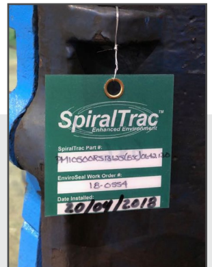
Green SpiralTrac Tag on Equipment

For more information please send an email to us at support@enviroseal.ca . We hope to hear from you!