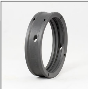
Packing Version SpiralTrac

EnviroSeal always recommends flow controls when installing a Packing Version SpiralTrac.