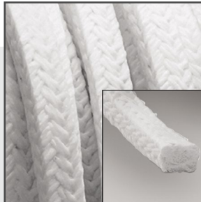
Chesterton 1730 Mill Pack Packing