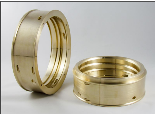
Packing Version SpiralTrac

EnviroSeal always recommends flow controls when installing a Packing Version SpiralTrac.