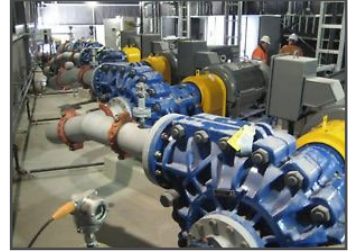
Warman Slurry Pumps

Customer used the kit supplied by a competitor and always had issues with constant loss of product. Customer is looking to decrease or eliminate this product leakage.