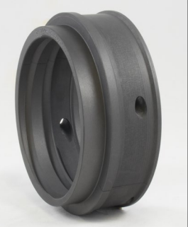
Packing Version SpiralTrac designed to fit Krebs millMax Slurry Pump