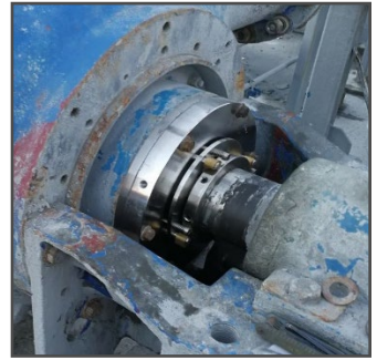
Chesterton Solution (170 Seal + SpiralTrac) installed in Warman Pump

To date, the Chesterton specialist has sold more than 20 additional sealing solutions to the customer.