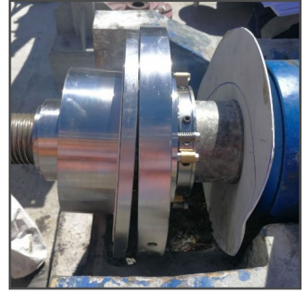
Equipment being assembled together

Improvements had to be made in the sealing of the equipment, because the original seal only lasted one month on average.