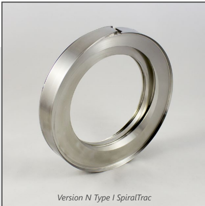
Version N Type I SpiralTrac