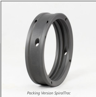
Packing Version SpiralTrac