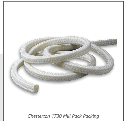
Chesterton 1730 Mill Pack Packing

For more information please send an email to us at support@enviroseal.ca . We hope to hear from you!