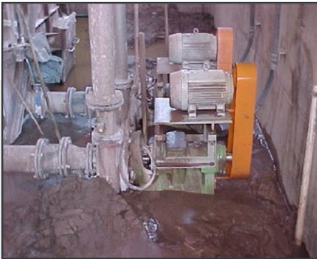
Product leakage, dirty environment before installation of SpiralTrac